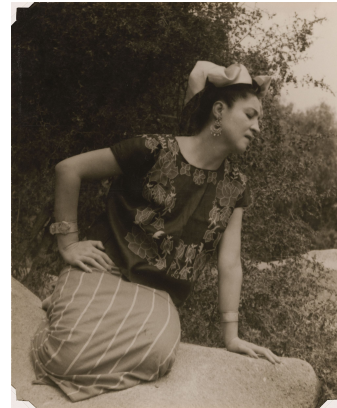
Olga Tamayo, circa 1940