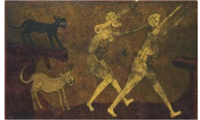
Dos Personajes Atacados por Perros, 1983