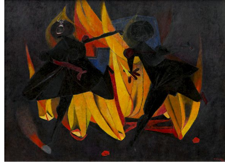
Niños jugando con fuego (Children Playing with Fire), 1947