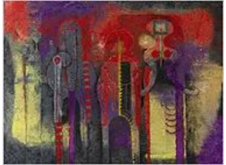
Tres Personajes, 1970